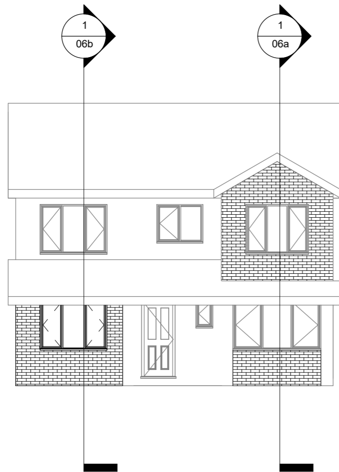
1 South 1 : 100